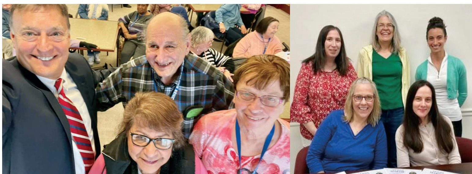
Our Senior Resources staff