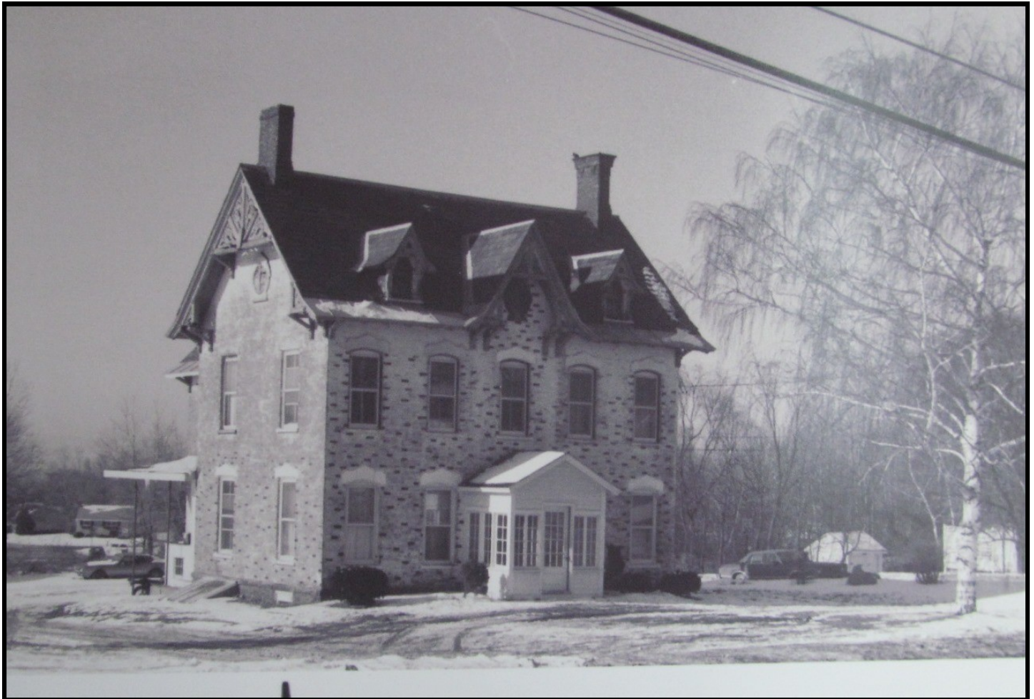
1982 photo of the Frederick Cramer House