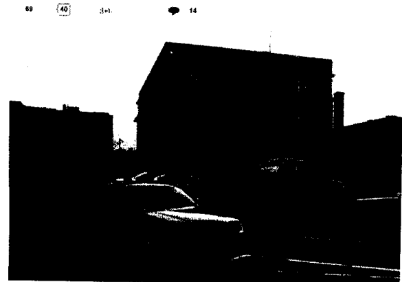
Site and medical personnel respond to the scene of a shooting at the Middletown court building lednesday.