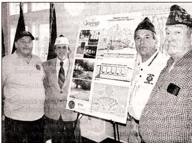
TOWN OF COLONIE

"The memorial's location is fitting," LaDuke said. "Thousands of kids go to the playground with their parents, and if they want to go over and see what's there, their parents can give them a little