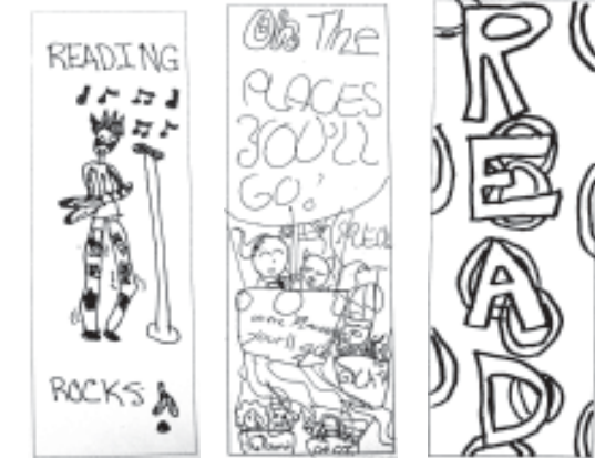
October Shreya, Age 8 November Eileen, Age 9 November Elaina, Age 10