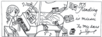
▼ October Zoe, Age 11