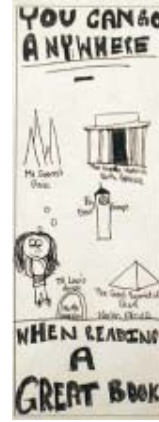
September Haleigh, Age 12