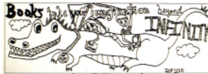
October Zoe, Age 10