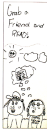
August Elaina, Age 9