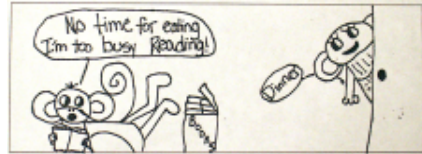
January Angela, Age 9